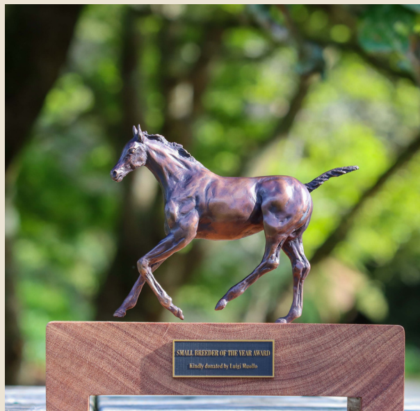
NEW ZEALAND SMALL BREEDER OF THE YEAR