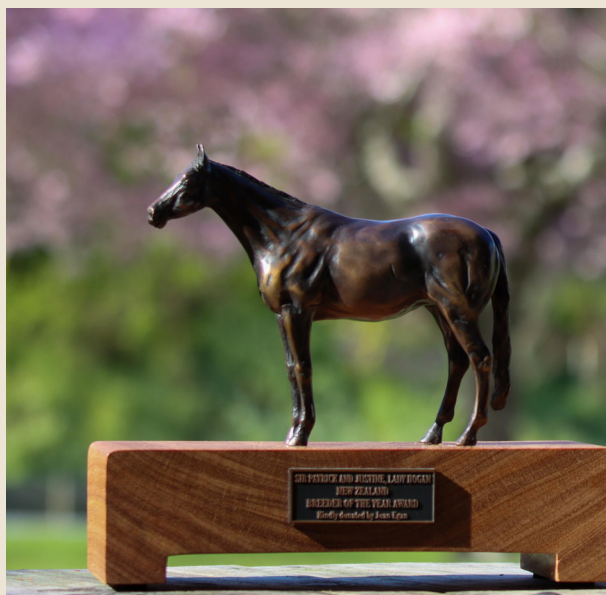
SIR PATRICK AND JUSTINE LADY HOGAN BREEDER OF THE YEAR AWARD