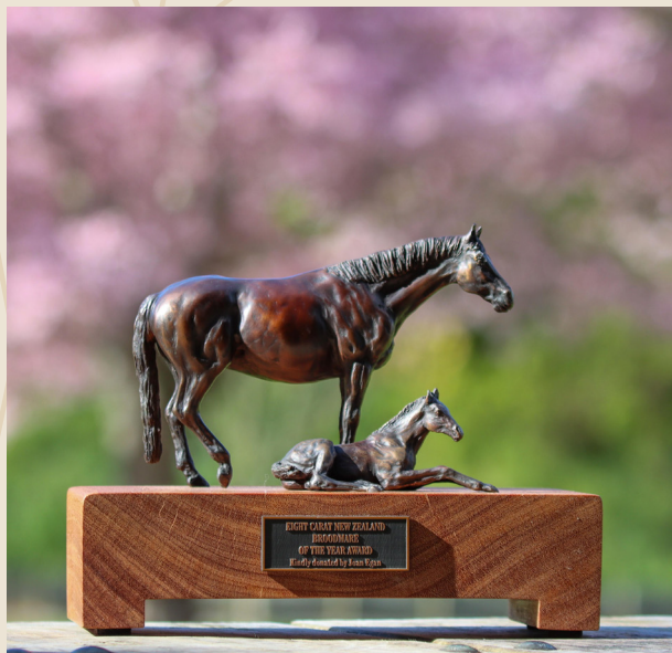
EIGHT CARAT BROODMARE OF THE YEAR